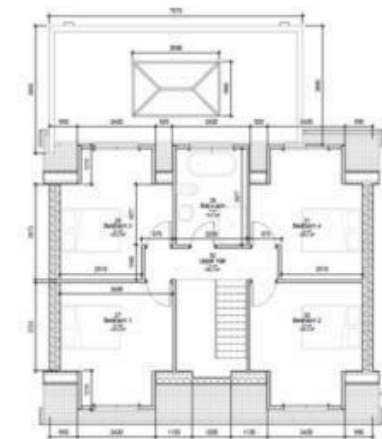
1 L01 - First Floor 1:50