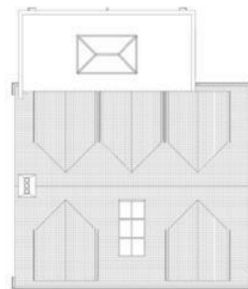
2 R00 - Roof 1:50